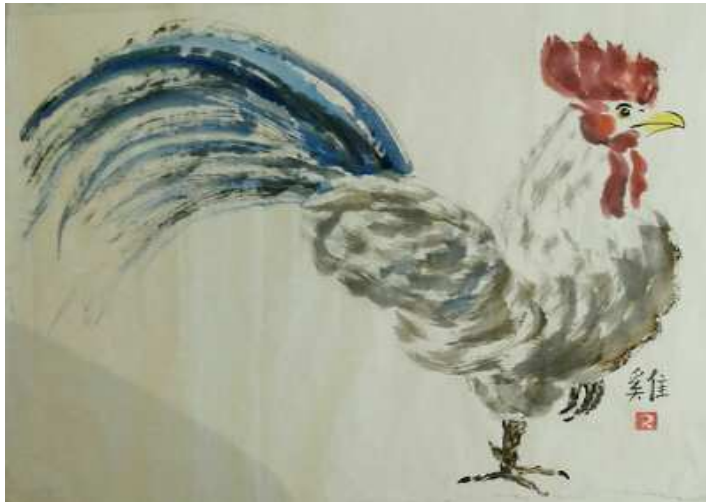
Painting by Reg Robinson

Is anyone interested in Chinese Brush Painting? If you are, then please email me at u3anewark@outlook.com . I can then arrange an inaugural meeting to determine venue, day, equipment and materials required. No previous skills or experience are required to join the group. Reg Robinson