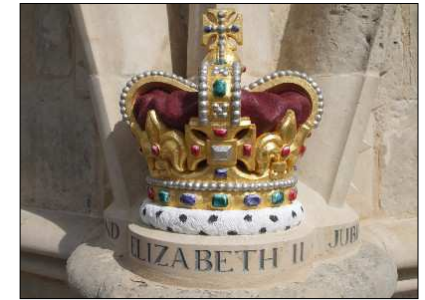
This crown was carved for the Queen's Jubilee. Paul got special permission to paint it. It is the only painted carving inside the cathedral.