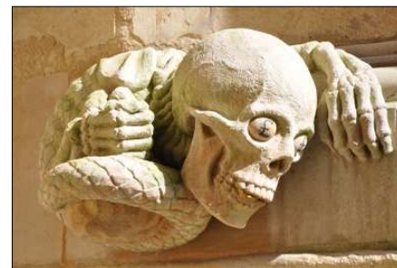
Paul's interpretation of 'Greed' was used by the BBC to introduce one of their drama productions