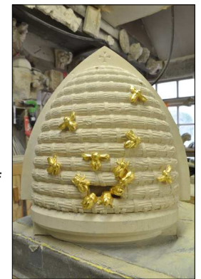
A guided beehive on the outside of the cathedral was sponsored by a local beekeeper