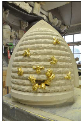
A guided beehive on the outside of the cathedral was sponsored by a local beekeeper