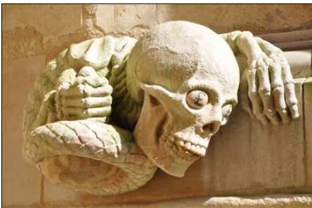
Paul's interpretation of 'Greed' was used by the BBC to introduce one of their drama productions