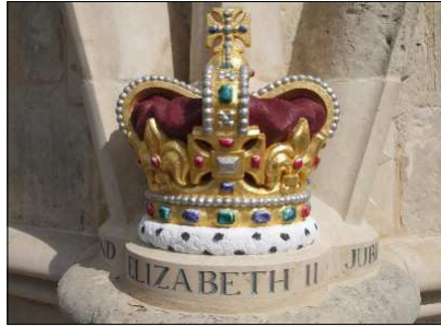
This crown was carved for the Queen's Jubilee. Paul got special permission to paint it.. It is the only painted carving inside the cathedral.