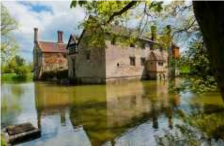
Baddesley Clinton Winchester Cathedral