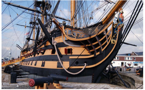
Portsmouth Historic Dockyard Old Sarum